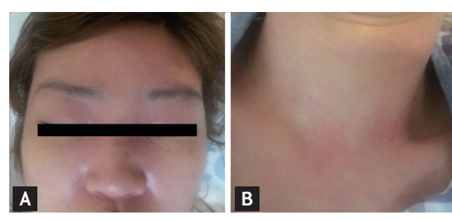
Figure 1 . Clinical pictures. (A) Edema of the eyelids and diffuse erythematous papules were seen on the forehead, and nasal bridge. (B) Erythema of the neck.

showed positive antinuclear antibody (1:2,560) with negative anti-JO-1, anti-dsDNA, anti-Smith antibodies, anti-Ro, and anti-La, while complement levels were normal. Magnetic resonance imaging (MRI) of the pelvis showed multifocal high signal areas with enhancement at the gluteus, obturator, quadrates femoris, vastus, and gracilis muscles (Fig. 2A). Electromyography showed increased insertional activities, fibrillation potentials, and positive sharp waves in the biceps, deltoid, extensor digitorum communis, gastrocnemius medius, tibialis anterior, and vastus lateralis muscles indicating active myopathy. Skin biopsy from an erythematous lesion on the dorsal hand showed perivascular lymphocytic infiltration. Muscle biopsy from the biceps muscle revealed a perifascicular atrophy pattern (Fig. 2B). Based on the clinical characteristics and laboratory findings, we diagnosed the patient with cervical cancer-associated DM.