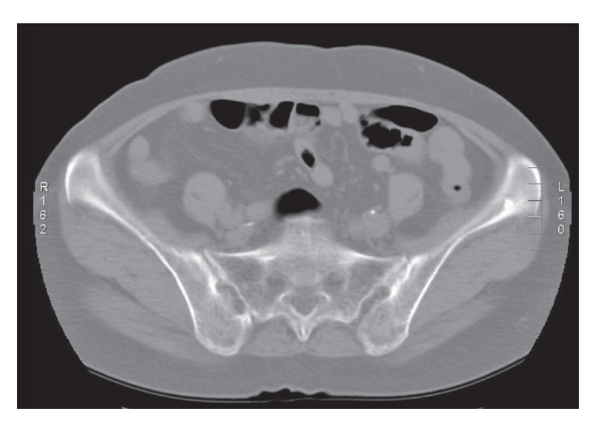
Figure 2. Computed tomography of the pelvis shows intraarticular bony ankylosis and erosion with pseudo-widening in both sacroiliac joints.

To our knowledge, this report is the first to describe the coexistence of primary aldosteronism and AS in a middle-aged woman. Whether these two diseases developed in the same patient accidentally cannot be excluded, but these diseases were thought to be related to each other. Until now there has been no literature about direct association of primary aldosteronism with spondyloarthropathy. However, increasing evidence has shown that innate and adaptive immune responses are modulated by aldosterone, which promotes inflammatory cytokine production such as TNF- \alpha . In addition, the observation that aldosterone can promote CD4+ T cell activation and Th17 polarization suggests that this hormone could contribute to the onset of autoimmunity [3]. TNF- \alpha and interleukin (IL) 17 are also important cytokine in spondyloarthritis [1]. Therefore, we thought that primary aldosteronism may stimulate or worsen autoimmune inflammatory diseases.