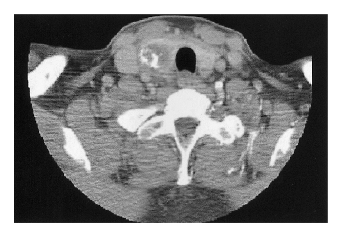
Figure 1. Neck CT showing a low attenuated, calcified mass with a maximum diameter of 3 cm in the right lobe of the thyroid gland.