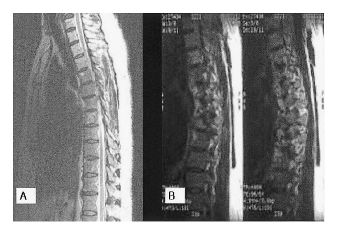
Figure 4. (A) Spine MRI demonstrating the 'Bull's eye' lesion with slight enhancement at T7, suggesting metastasis in February 1998. (B) The metastatic lesion with compression fracture and epidural mass formation on T7 and other newly identified metastatic lesions at T1, T4, T5, T6 and T8 spines were detected on spine MRI in November 2000.

reported in the English literature<sup>1-6, 9-14)</sup>. In Korea, nine patients with primary squamous cell carcinoma of the thyroid have been reported<sup>15-22)</sup>. Of these reported patients, only three have survived more than six years after diagnosis<sup>5</sup>. Cook et al. reported 16 patients with primary squamous cell carcinoma of the thyroid who underwent thyroidectomy between 1936 and 1997. Among these, a 69-year-old woman lived for 16 years after the initial diagnosis. In addition, a 78-year-old and a 55-year-old woman died from heart failure 6 and 21 years after diagnosis, respectively. All reported patients had undergone complete tumor excision and had received 60 Gy of external radiotherapy to the neck. The squamous cells of squamous cell carcinoma have no affinity for iodine as they do not possess intracellular TSH receptors<sup>11)</sup>. and thus, radioactive iodine and TSH suppression therapy have little impact on its clinical course<sup>6, 9, 10)</sup>. Most primary squamous cell carcinomas of the thyroid recur postoperatively and complete tumor excision is the only curative modality; although external radiation therapy to the neck likely has a role as postoperative adjuvant therapy<sup>5, 9)</sup>.