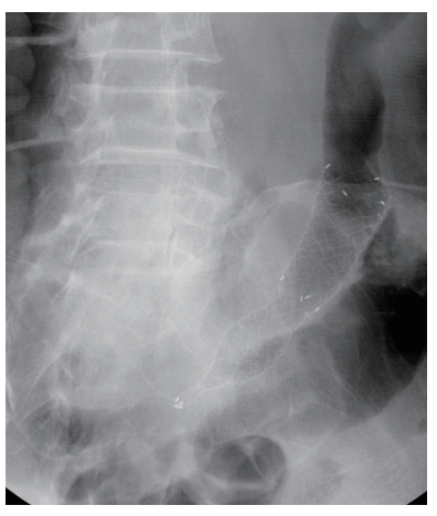
site of perforation.