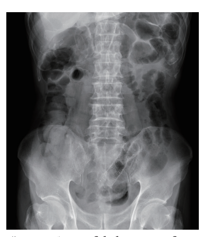
Figure 3. Successful placement of covered metal stent.